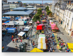
Rennes – France