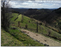
Southern Ardèche – France