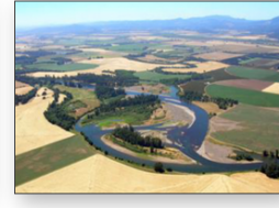
Willamette Valley, Oregon – USA