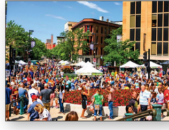
Madison Food Policy Council – USA